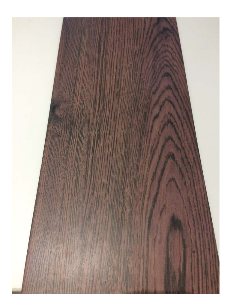
PET flooring with digital print